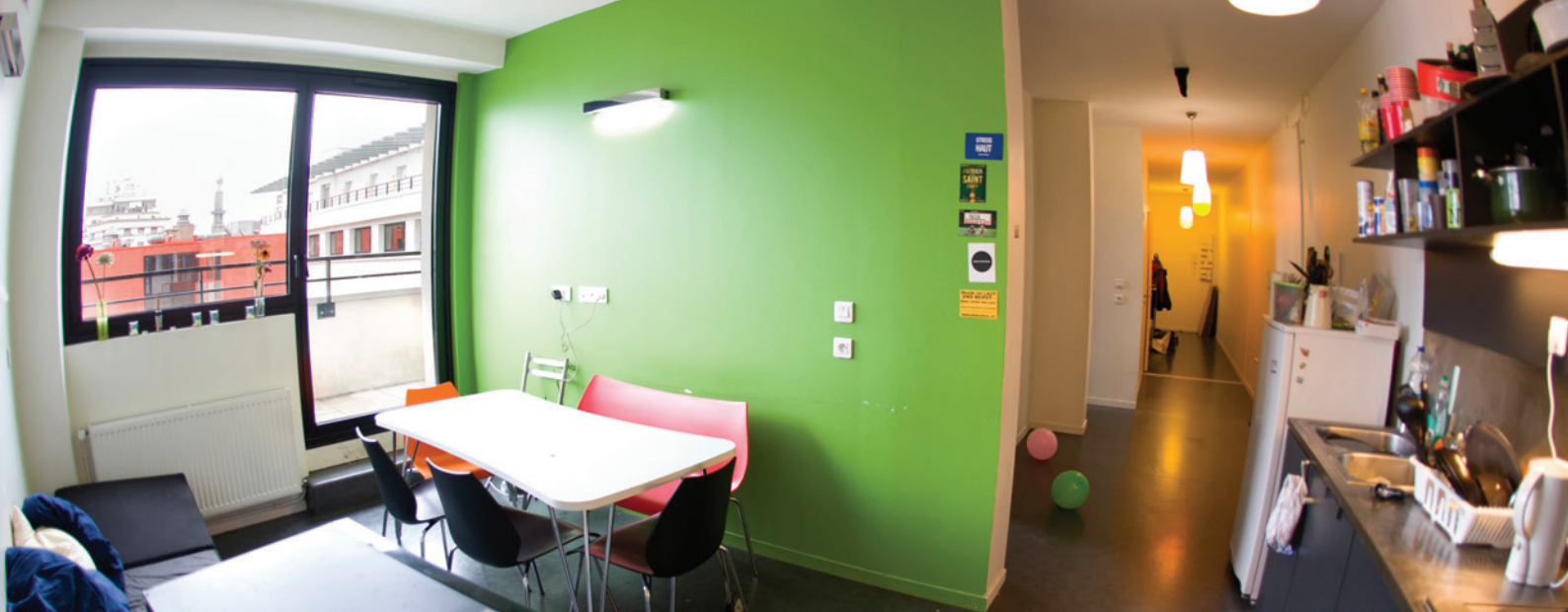
shared apartment at the Maison des étudiants (CROUS)