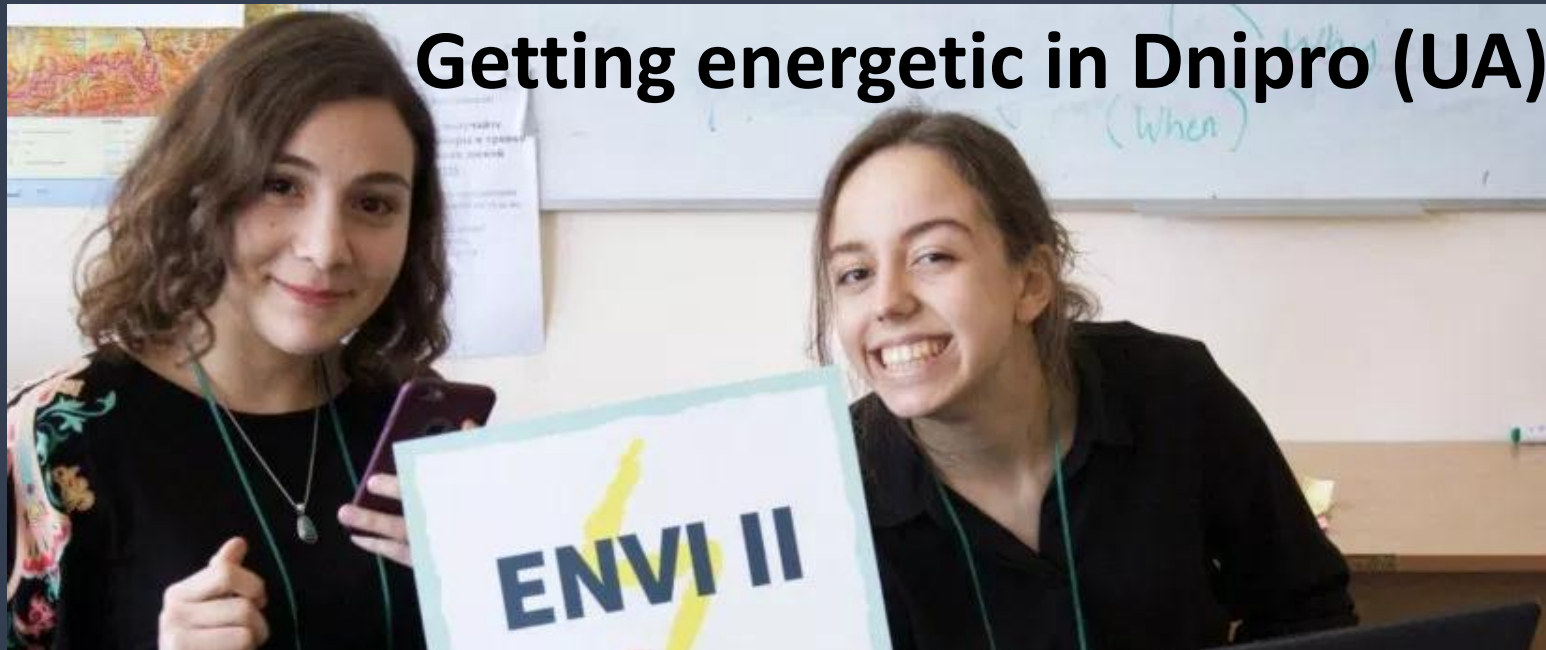
Getting energetic in Dnipro (UA)

This May 2019 - 82 participants from Ukraine and elsewhere in Europe came together to discuss crucial issues in the energy sector at the Regional Session in Dnipro (Ukraine) under the motto “Heading towards safe, secure and sustainable energy”.